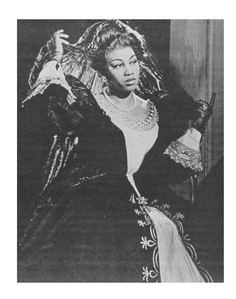
Leontyne Price as Donna Anna in one of her many performances in that role at the Met

Voice type: Dramatic coloratura soprano. Donna Anna requires both a large sound that can across loud orchestral figures (the "dramatic") as well as the agility to handle blazing runs of fioritura, or twisting, high speed vocal ornaments (the "coloratura").